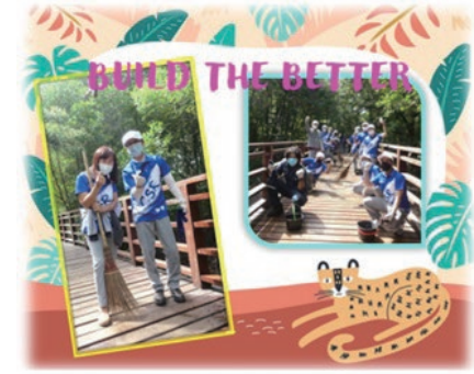
Mangrove forest clean-up project

The company will continue efforts to realize a sustainable society.